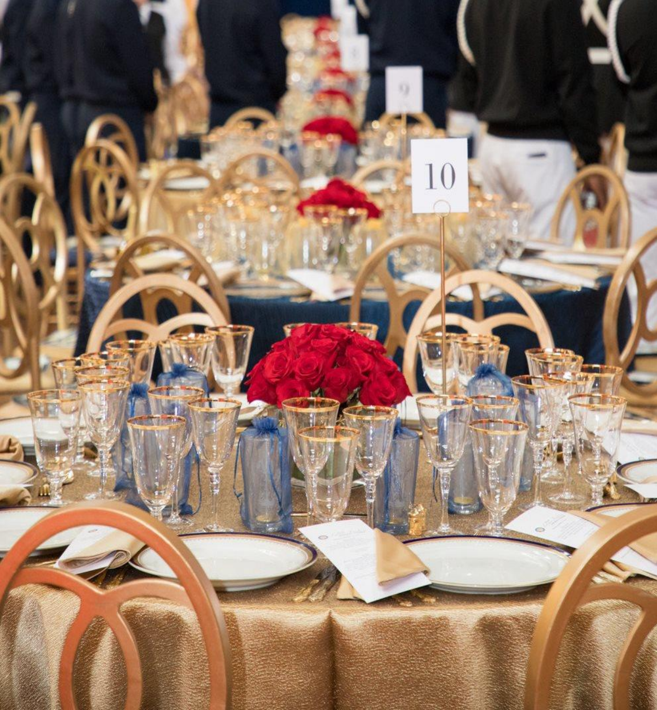
Table Sponsor - Cluster